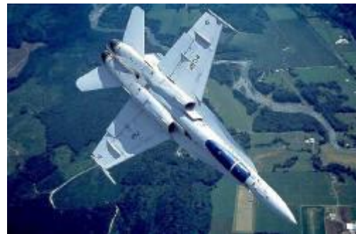
Figure 2a: Canadian CF-18 with False Canopy painted on underside (all CF-18's are painted this way)

Now many military aircrafts use new stealth technology which makes airplanes invisible not only to radar, but it renders them partially hidden to the human eye as well – just like an invisibility cloak in a Hollywood science fiction movies. They use nano enabled coatings which makes the aircraft invisible. Some Military aircrafts are painted to match the sky when viewed from below and to either match the ground or break up the aircraft's outline when viewed from above. 3 Aircraft designers decrease the flight vulnerability to missile attack by using many camouflage and suppression techniques. These include reducing the aircraft's radar reflectivity by using nonreflecting materials and radar-absorbing paint, when practical. (Shaw 1985:55) The best example for military camouflage is Canadian CF-18 as shown below. 4