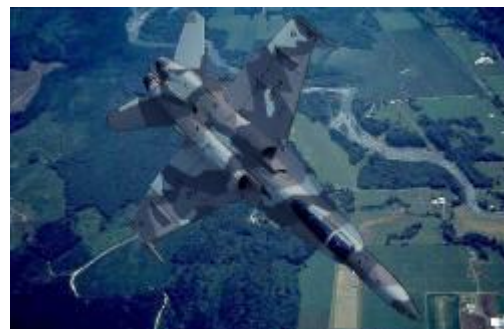
Figure 2b: Hyper Stealth Simulation on same photo with improved Lightning Disruption Pattern, note how the pattern reduces the visual aspect on the air intakes thus increasing the effect of the false cockpit to confuse an adversary