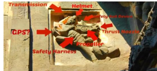
Figure 3: A 1200 Year Old Vimana - Alien Flying Machine (Ellora Caves) 6

represents the same. It is comparable with our most advanced and fascinating flying devices of modern times called Jetpacks.