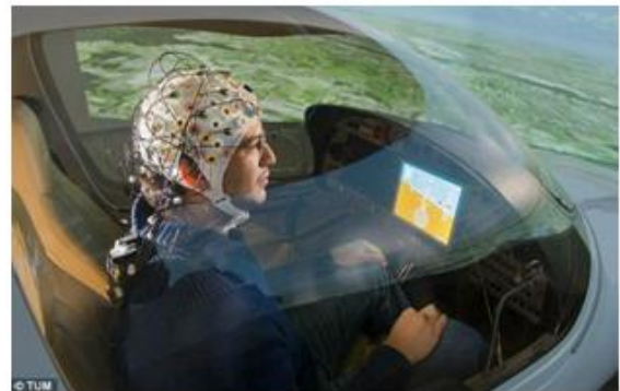
Figure 5: Mind control has reached new heights after a group of pilots were able to successfully fly a plane using nothing but their thoughts. German scientists showed how seven pilots, some with no previous experience of flying used mind control to fly with ‘astonishing accuracy’. 8